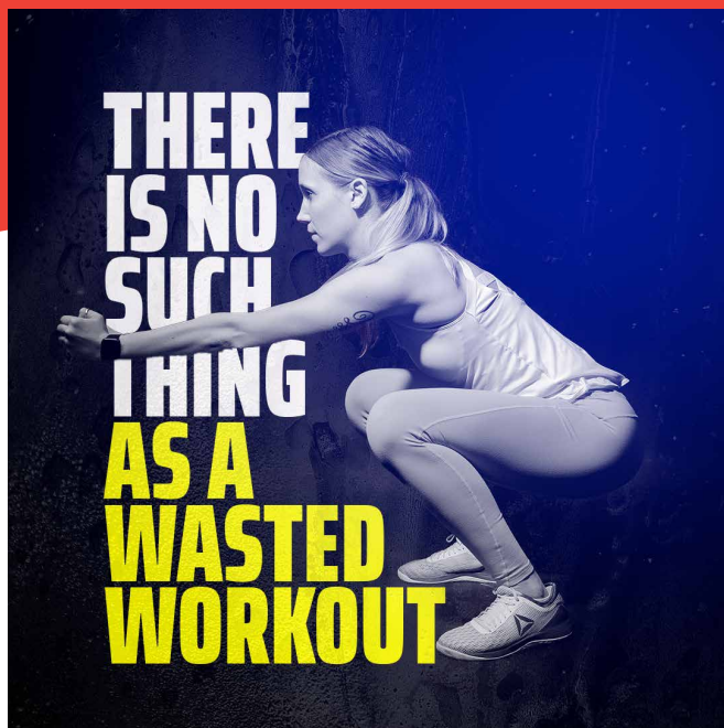
Saira Extra Condensed Black